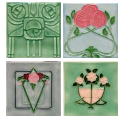
Designs from Porteous Tiles.

artdeco.org.nz The Art Deco Society Auckland has put together wonderful information on 1920s-50s architecture, art and style. >