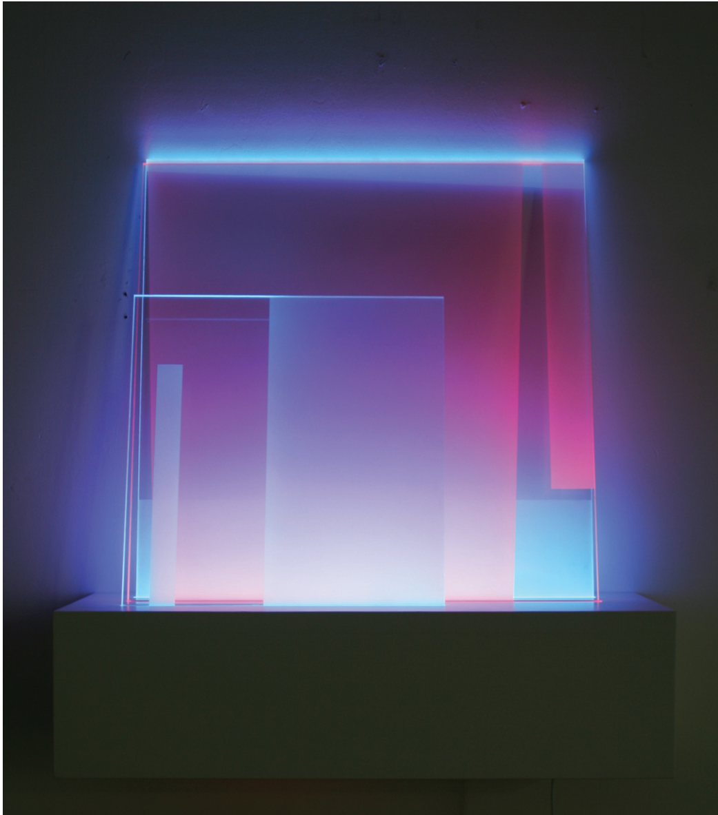
Untitled (En Abye) , 2006, Customwood, perspex, LED lights and paint (edition of 3), 600 x 600 x 45mm